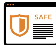
System status portal