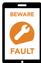
Fault detection push notifications