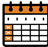
Weekly test record