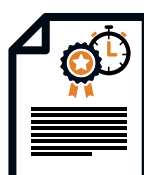
Legislation & KPI compliance