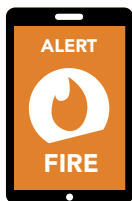
Emergency push notifications