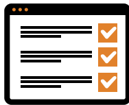
Fool-proof device servicing log