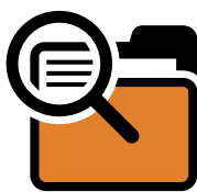
Full auditable trail