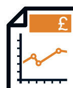
Simple & cost effective to retrofit